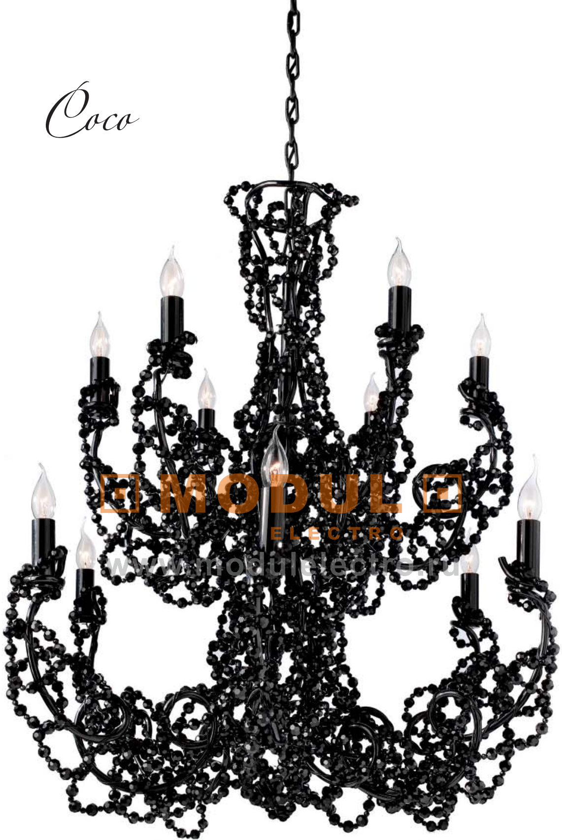
COCOCC80BL , Coco, chandelier round, Ø 80 cm, Height 95cm, 12 x E14, black finish