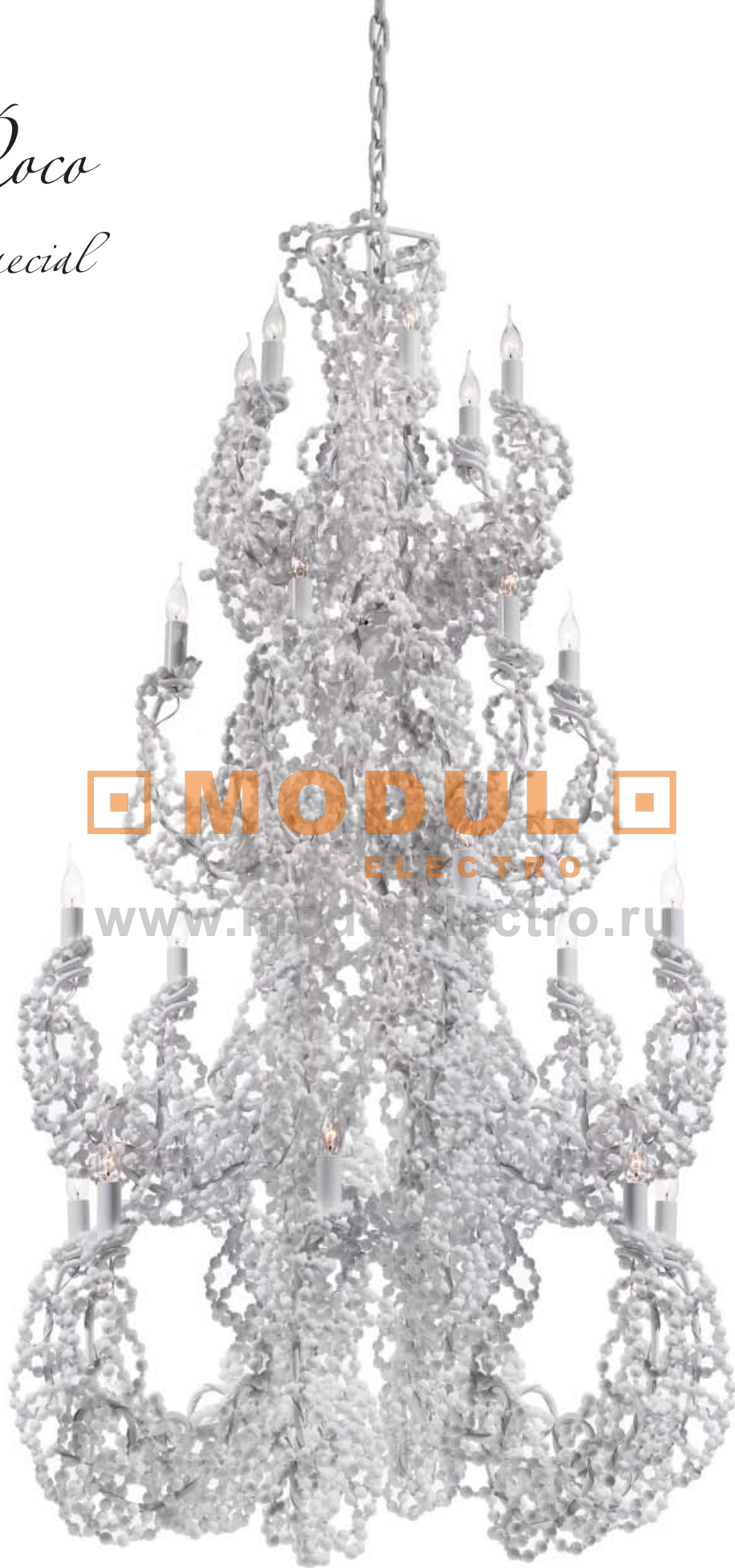
Special, Coco , chandelier round, Ø 90 cm, Height 200 cm, 24 x E14, white finish